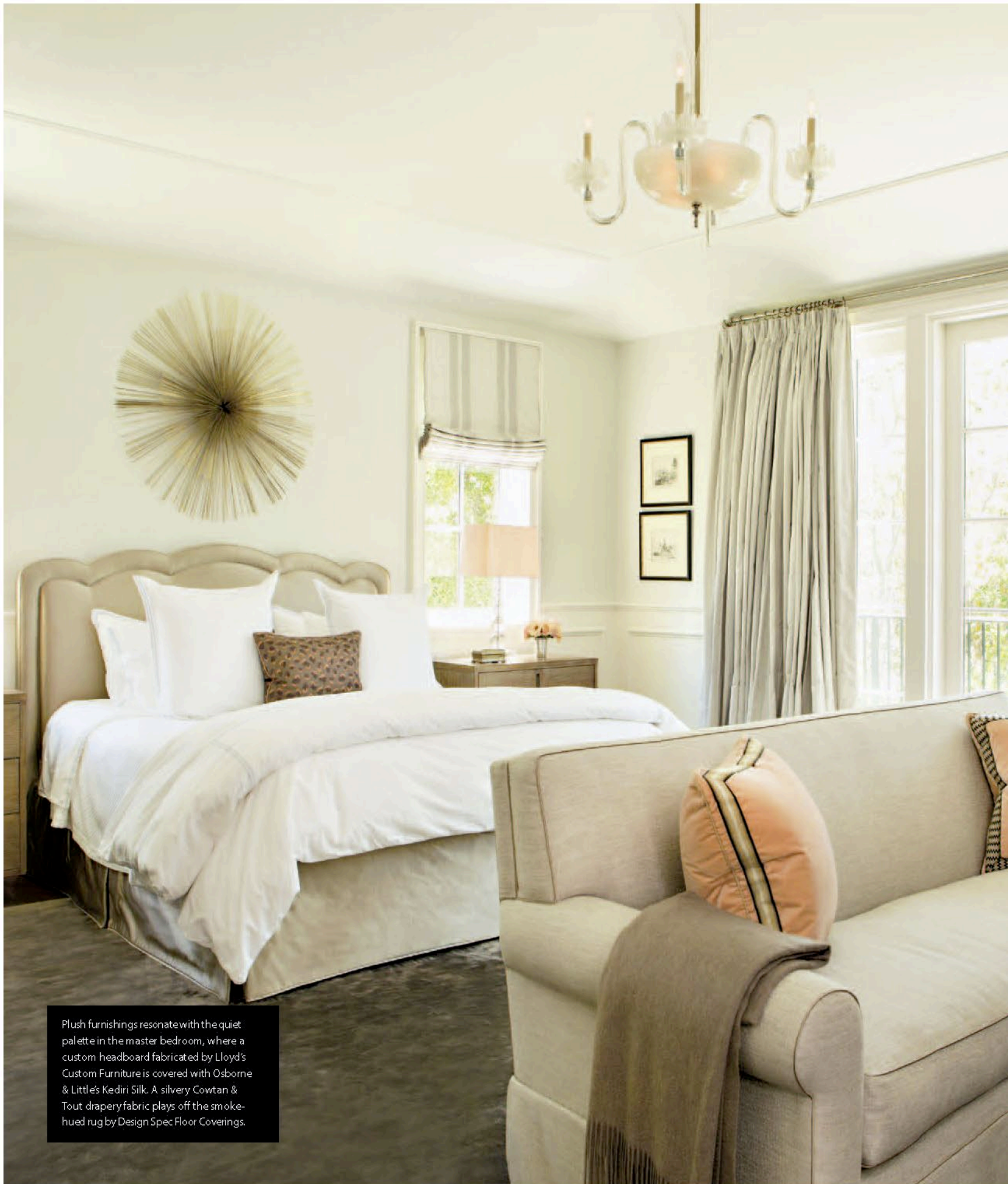
Plush furnishings resonate with the quiet palette in the master bedroom, where a custom headboard fabricated by Lloyd's Custom Furniture is covered with Osborne & Little's Kediri Silk. A silvery Cowtan & Tout drapery fabric plays off the smoke-hued rug by Design Spec Floor Coverings.