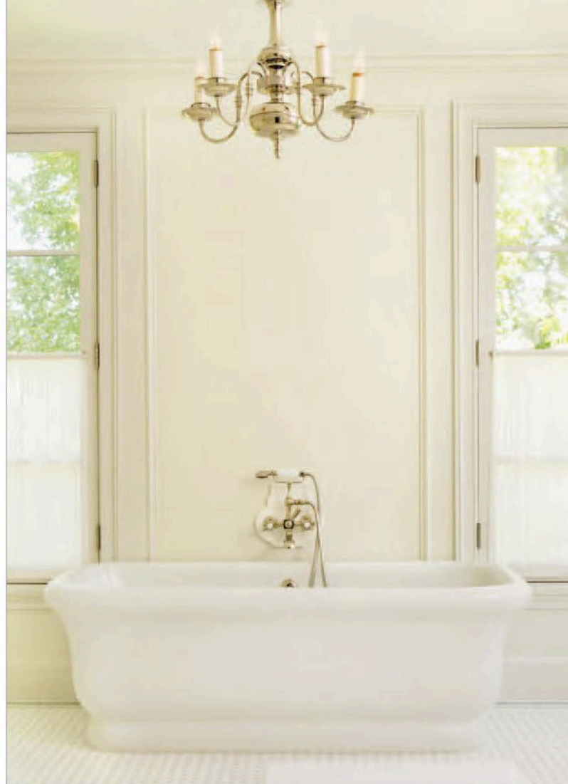
The master bath's Empire tub is appointed with the Astoria tub filler, both by Waterworks. A 19 th -century French silver-plated chandelier from Tod Carson illuminates the space. The basket-weave flooring is also by Waterworks.